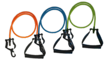
RESISTANCE BANDS 3 LEVELS AVAILABLE