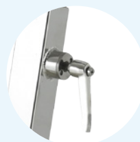
Fast settings Click & Turn