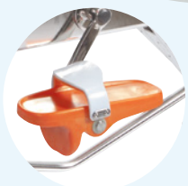
Barefoot comfort pedals