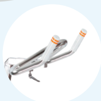
45° sport handlebar pedals